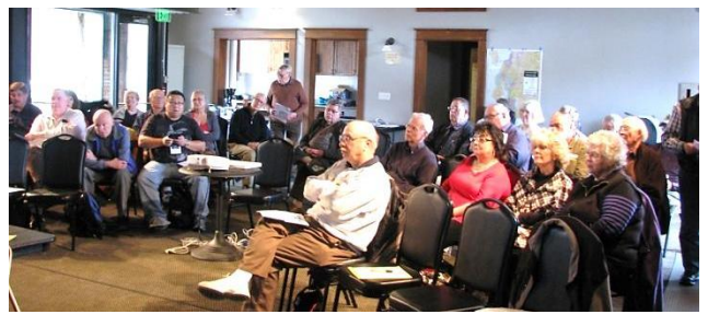
Nearly 40 people attended the All Aboard Washington general membership meeting at Centralia's Amtrak Station on Nov. 2.

Your All Aboard Washington board and Cascadia have developed what is called a Fiscal Sponsorship Agreement, which your board approved at our Annual General Membership meeting in Centralia on November 2<sup>nd</sup>. Under this agreement, Cascadia brings in donations and grants to fund shared (See Cascadia, page 5)