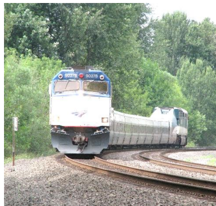
Of course, stress and frustration levels (and travel time) are also factors besides costs that people consider when traveling south to Portland. Here is I-5 at the Puyallup River on a typical Saturday afternoon and an Amtrak Cascades peacefully approaching the Lewis River.