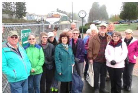
The Panorama City group prepares to board Cascades train 501 on Nov. 10.