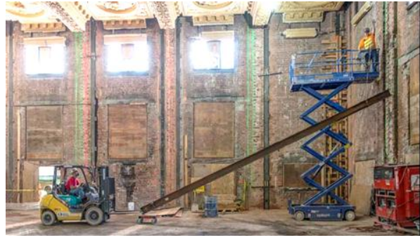
Workers hoist a steel beam that will be used to reinforce the wall. A winch on the second floor pulls the beam up and into place.

completion of the second and third floors of the building. They are being repaired and brought up to the same standards as