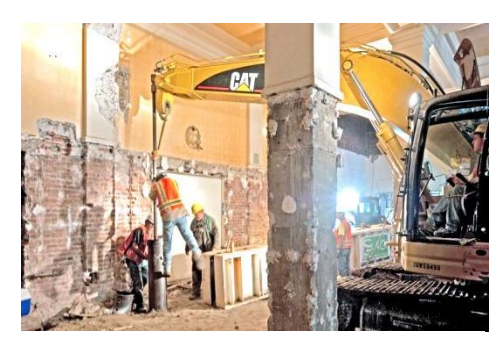
This picture shows the tight working quarters that make demolition and reconstruction more challenging.

replicates the elements as they were originally constructed.