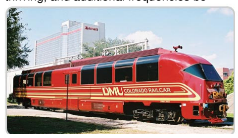
Colorado Railcar's single level DMU.

Still, Sound Transit has cushioned its initial over-investment in equipment by leasing some of it to transit agencies elsewhere, the Sounder Tacoma service is thriving, and additional frequencies be-