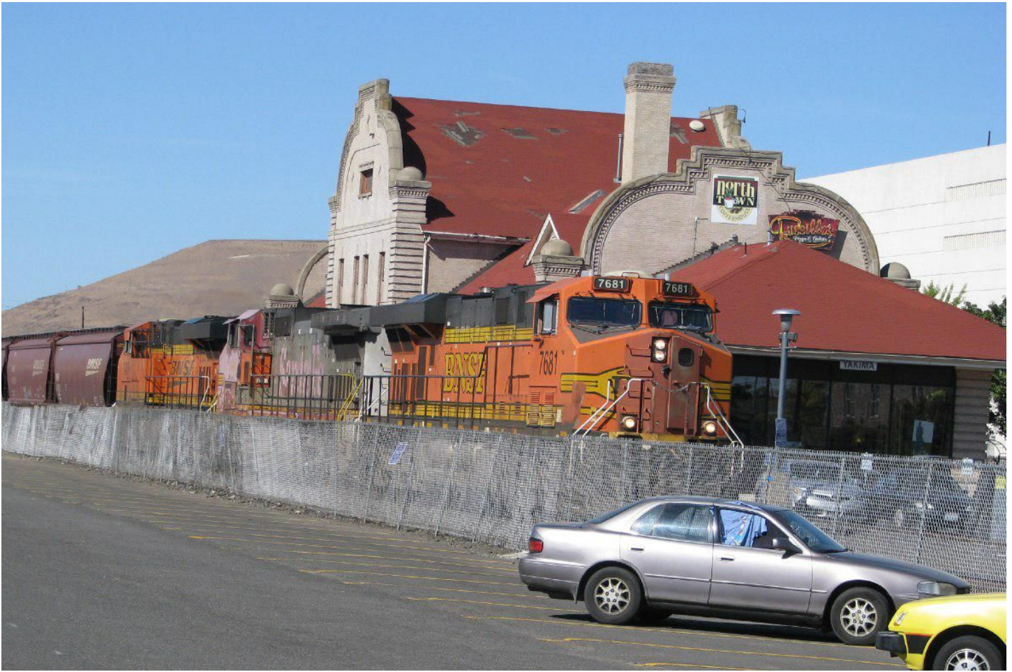
A BNSF freight train chugs by the old Yakima Station.