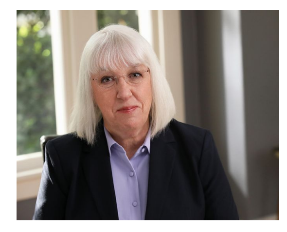
US Senator Patty Murray

https://www.aawa.us/new s/posts/december-2022-a awa-aorta-meeting/