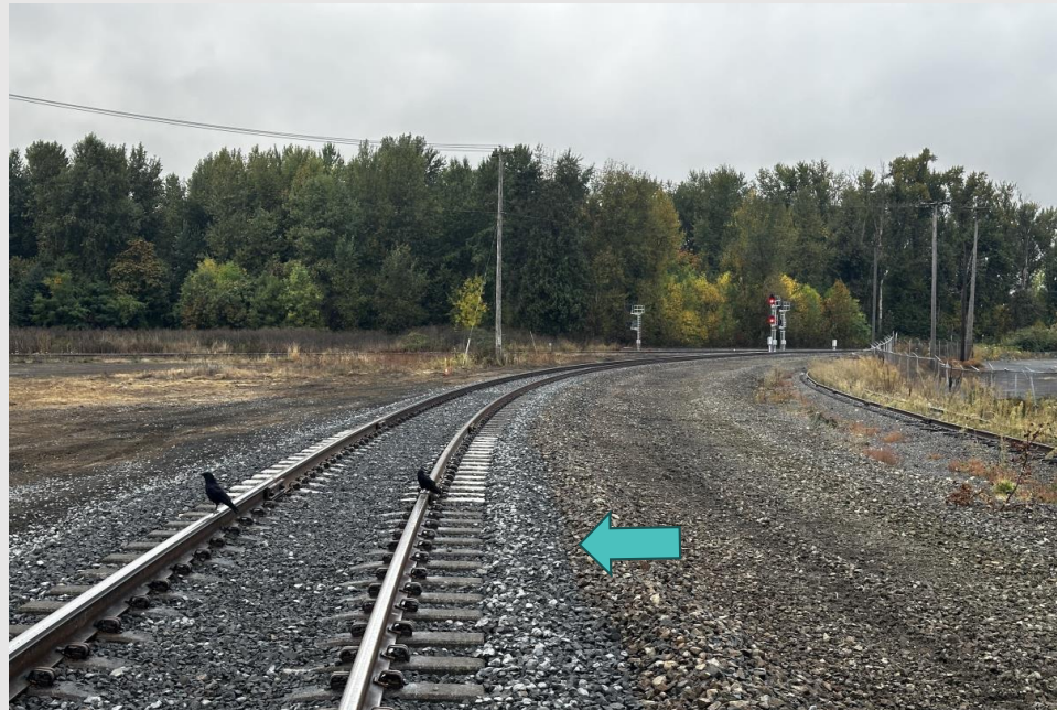
Peninsula Jct. curvature has been widened